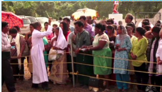
Holy Water being sprinkled on the faithful in Batim in October 2016 on one of the days of the 'Visitation' of Our Blessed Virgin Mary.

Our Blessed Mother explains why she appears to her beloved children: “ Why am I, in these times, making myself present to you in a new, continuous and extraordinary way? Because these are the times of the reign of my Adversary, the Red Dragon, Satan, the old serpent whose head I shall crush. Under the weight of his reign, there is an increase for you of trials