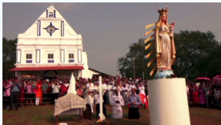
The faithful gather in Batim in October 2016 at the time of the 'Visitation' of Our Blessed Virgin Mary

When Our Lady appeared at Fatima, more than a 100 yrs ago, she presented to us a Peace Plan and warnings of events to come if her requests were not fulfilled. Our Beloved Mother has reinforced these messages and warnings at Batim. Upon studying the Messages of Batim, it is evident that Divine Justice is not far off and as a result Our Lady's messages and warnings have taken on a new urgency.